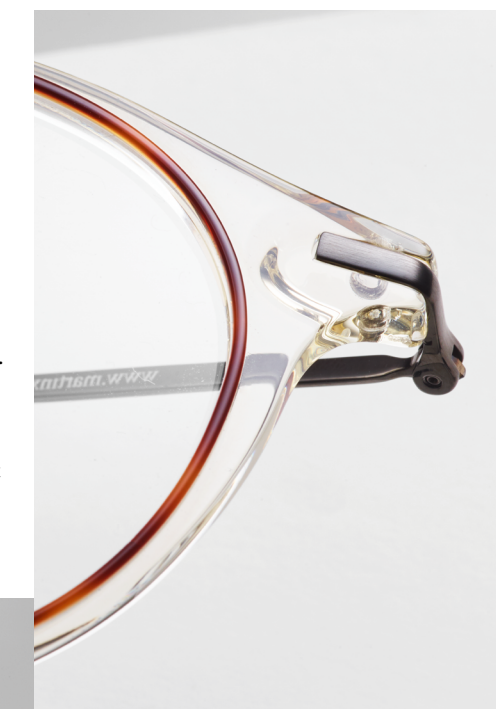
The »Wolf« model skillfully integrates metal temples into the frame.

bold design, but it only becomes apparent upon closer inspection. Viewed from far away, the frame seems very delicate.