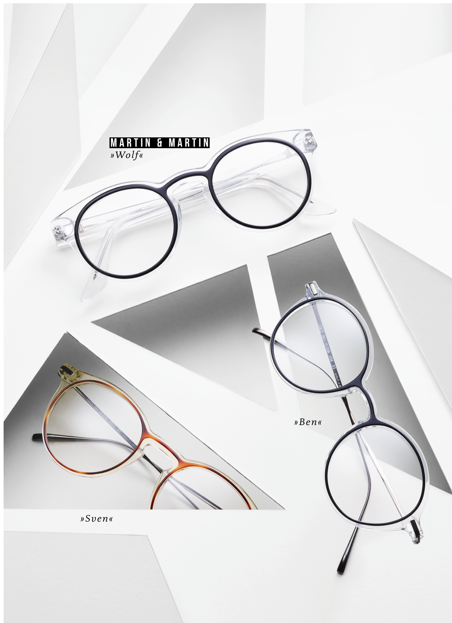
MARTIN & MARTIN »Wolf«